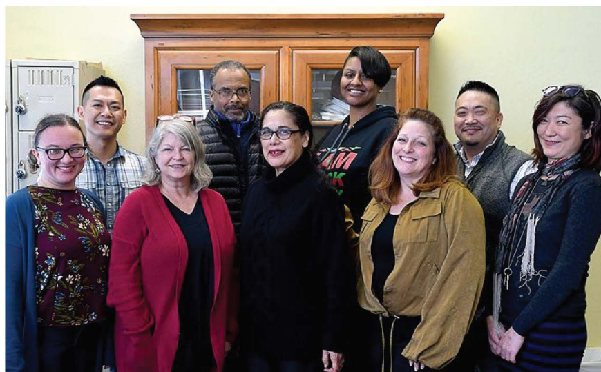
Workforce Development Staff

For more information, email: workforce@ecs-sf.org or call: (415) 487-3300 ext. 4127 or visit https://ecs-sf.org/workforce-development/