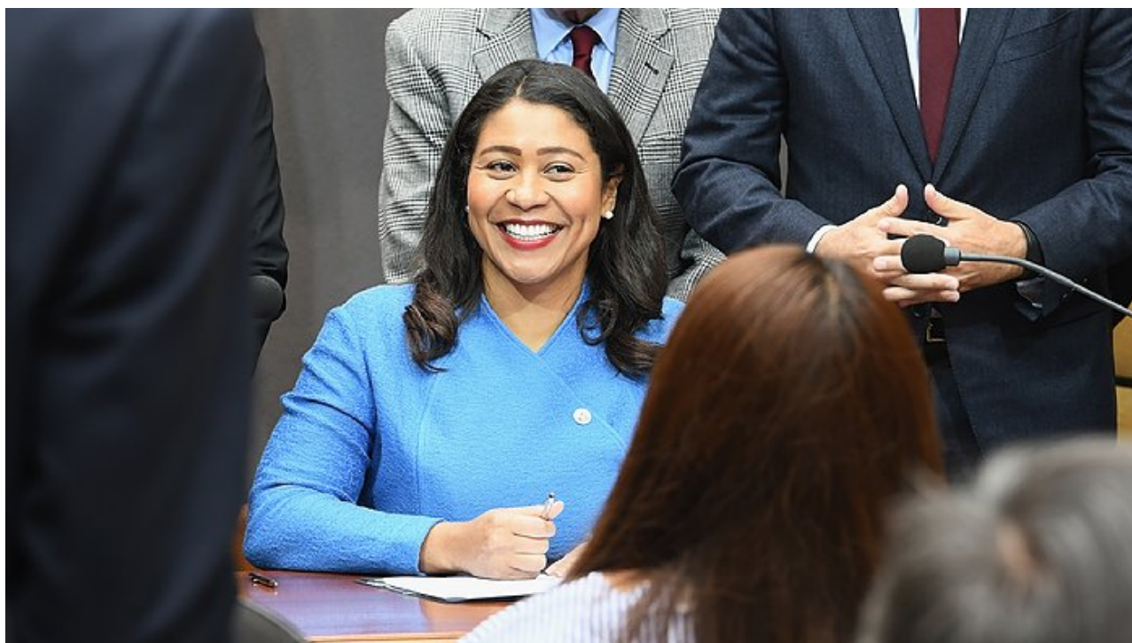
San Francisco Mayor London Breed